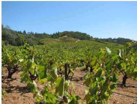
90 year old vines at Carreras Vineyard

Tasting notes: The '07 Zinfandel is made in a fruit forward style showing lots of raspberry and black cherry fruit. With flavors of blackberry and mocha, this beautifully balanced wine is rich and supple in the middle, finishing with ripe, juicy tannins.